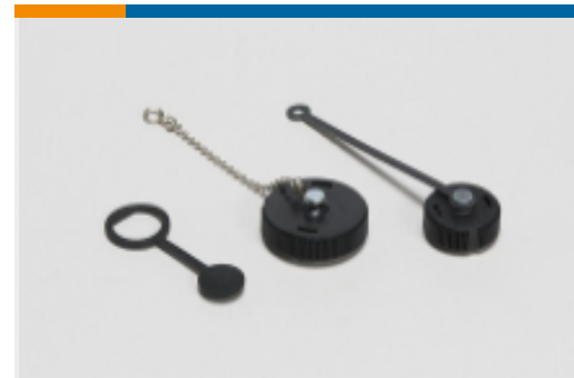
Circular Connector Caps &amp; Covers(16)